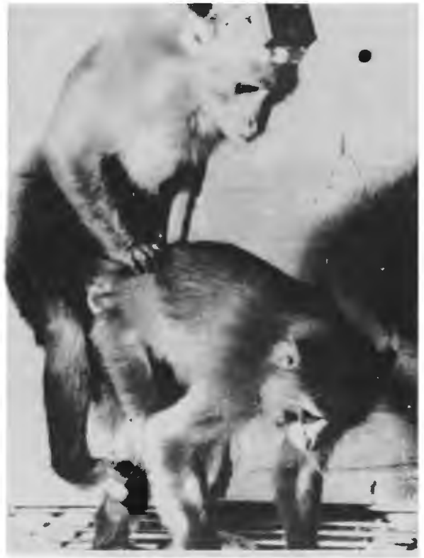
Fig. 2—Mounting evoked by telestimulation of the lateral hypothalamus.

different rooster was electrically stimulated to attack a small stuffed predator, culminating in attack with spurs and triumphant call. At the right, the same rooster which had always treated the keeper as a friend is shown attacking the keeper's face which appears to be a better substitute for an enemy than her hand. If all substitutes for an enemy are lacking, the rooster exhibits only motor restlessness. They concluded from duplicating various natural drives that stimulation of the brain stem set off essentially complete and normal processes and that effects of stimulation are therefore not imitations or "pseudo-affective" states but genuine drives. "The organism comprises a bundle of drives which support one another or oppose one another to greater or lesser extent. Spontaneous activity is the result of a continual and shifting interplay in forces of the central nervous system." Freedman et al report that electrical stimulation of the septal brain area in humans has halted epileptic seizures, dulled the pain of