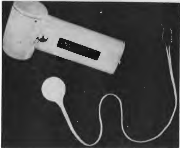
Fig. 1—Implantable stimulator and electrode assembly with portable transmitter.